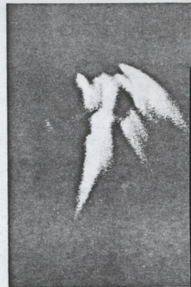
The 1977 "UFO" took off from the secret Plesetsk cosmodrome; (above) how it appeared to frightened observers