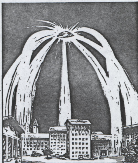
How the residents of Petrozavodsk saw the notorious UFO (left). But other, similarly bizarre, pictures have perfectly rational explanations—witness (below) the "jellyfish" effect caused by a routine Soyuz rocket launch in 1973

When this report eventually reached Moscow two days